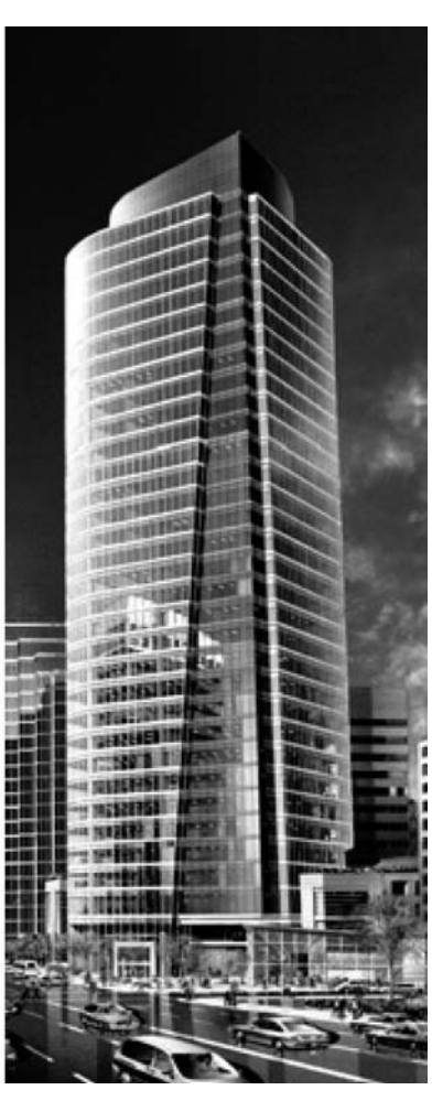
Plate 3. Bentall Five building in Vancouver

Notes: Phase I (left) and Phase II (right)