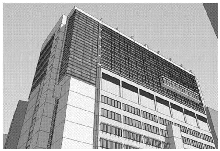
Sources: Architectural Resources Cambridge (2008); Pearson and Wittels (2008)