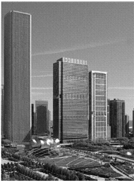
Plate 1. Health Care Service Corporation building in Chicago in center of image

Note: Phase 1 (left) and Phase 2 (right) Sources: Goettsch Partners (2008); Pearson and Wittels (2008)